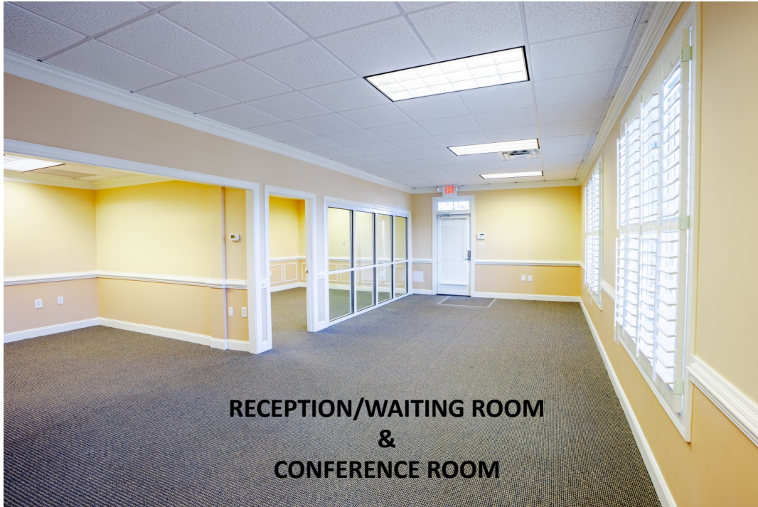
RECEPTION/WAITING ROOM & CONFERENCE ROOM

4236 University Drive, Suite 100 Durham, NC