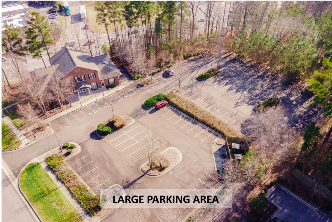
LARGE PARKING AREA