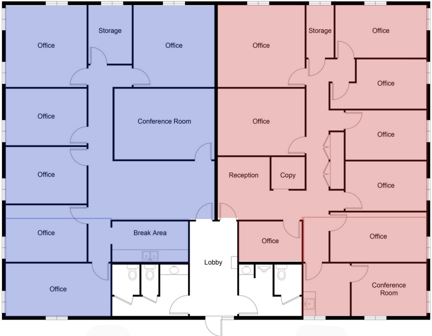
Suite 100 1,955 RSF