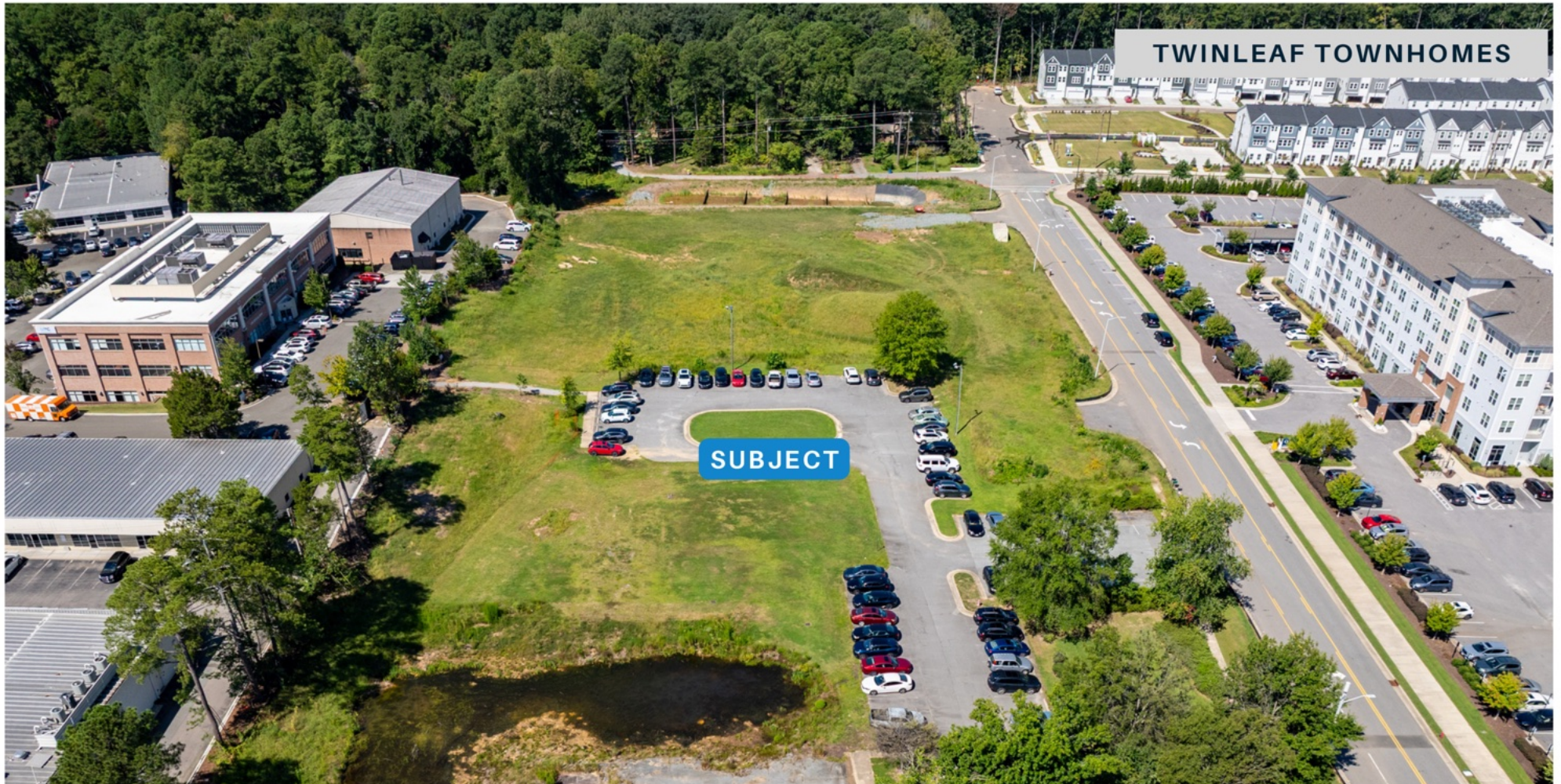
Looking west towards Twinleaf Townhomes

5936 Farrington Road offers 5.03± acres of prime land in a high-demand Triangle location. The site is fully approved for a six-story, 168,000 SF medical/general office building with a four-level parking garage.