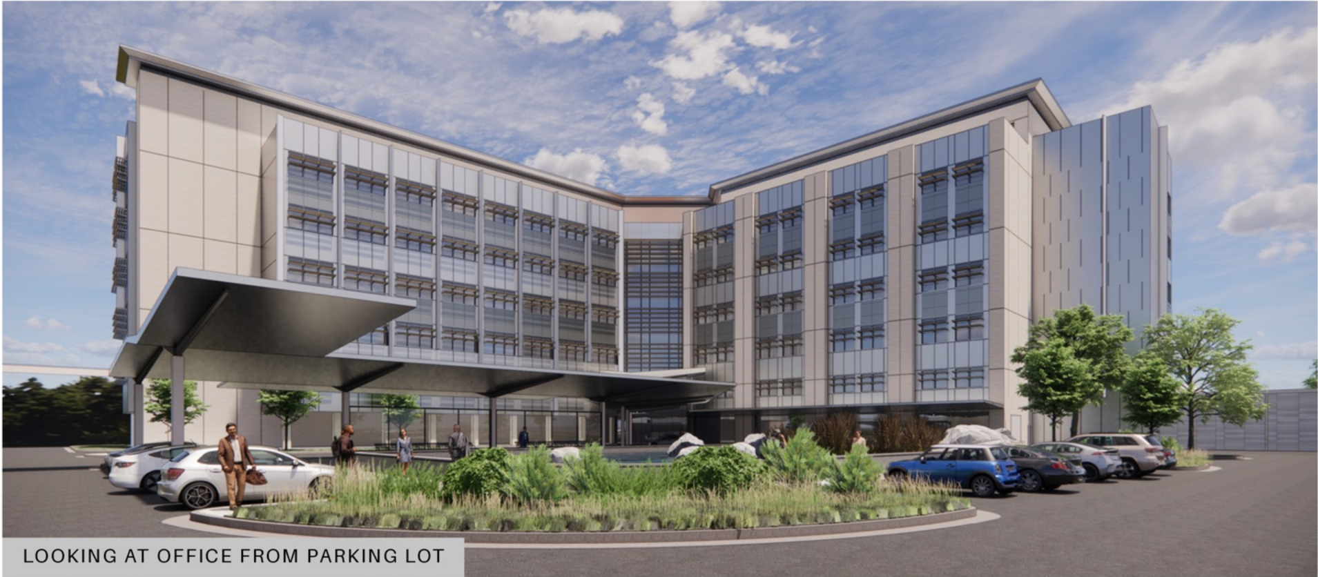
LOOKING AT OFFICE FROM PARKING LOT