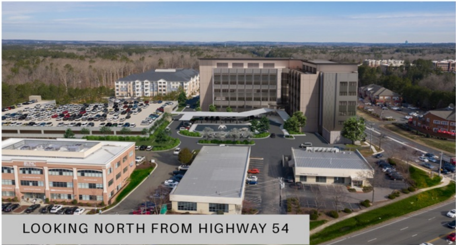
LOOKING NORTH FROM HIGHWAY 54