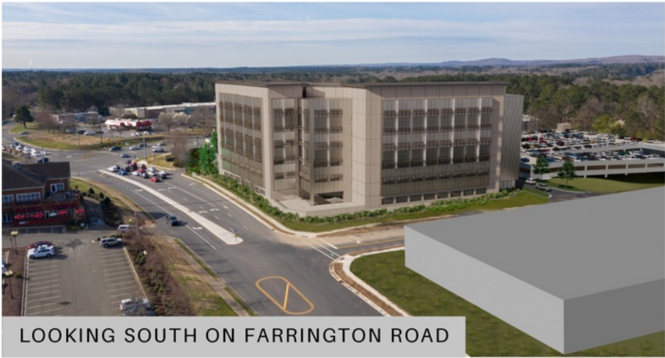
LOOKING SOUTH ON FARRINGTON ROAD