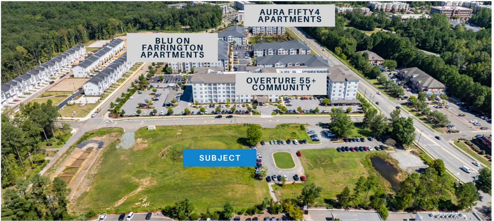
Looking north towards Overture 55+ apartment community, Blu on Farrington apartments, and Aura Fifty4 apartments

5936 Farrington Road combines strong visibility, high traffic access, and proximity to major employers and institutions. The site also offers flexible future potential development in one of the Triangle’s most desirable and growing submarkets.