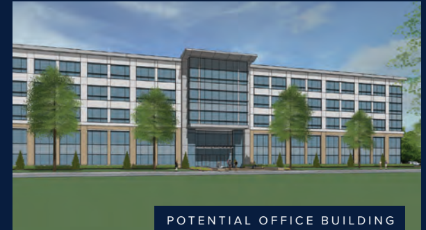
POTENTIAL OFFICE BUILDING