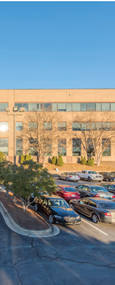
4301 RESEARCH COMMONS