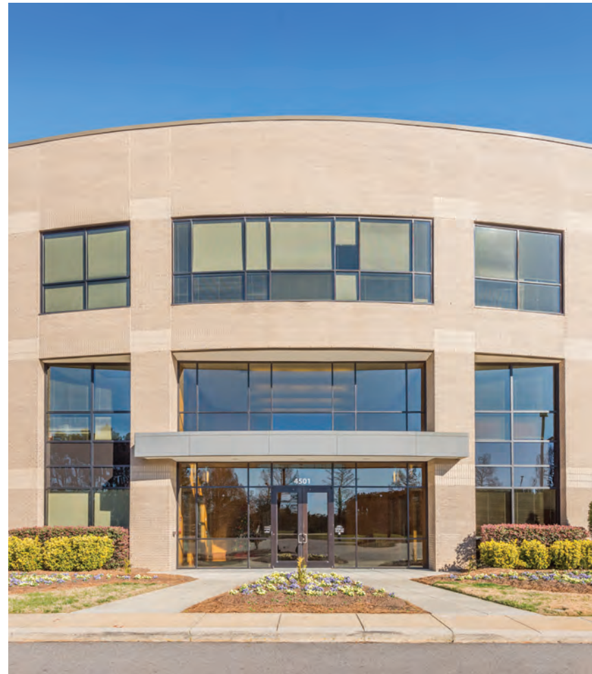
4501 RESEARCH COMMONS