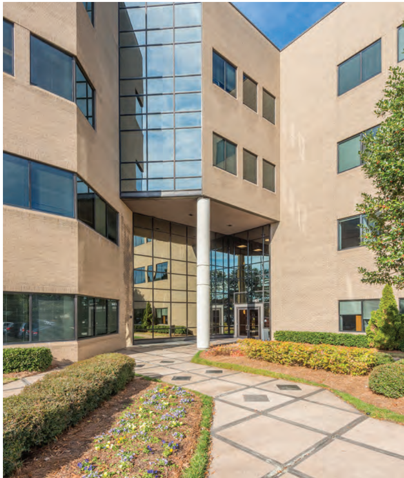
4401 RESEARCH COMMONS