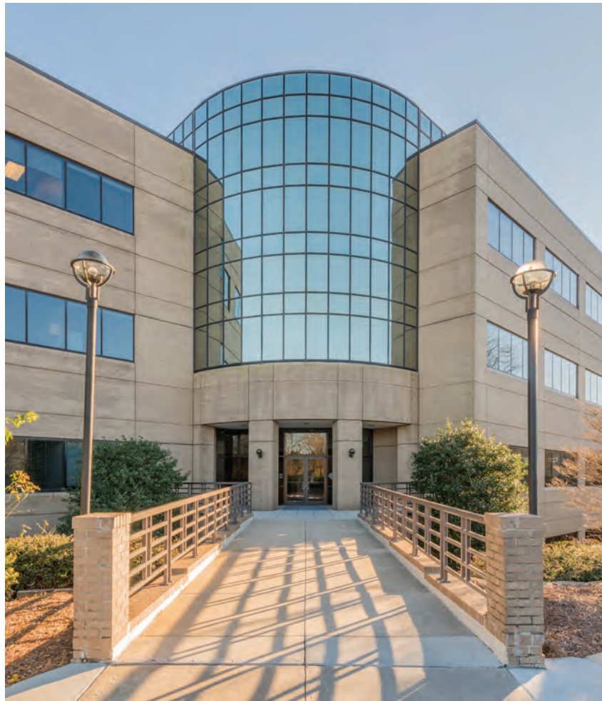
4201 RESEARCH COMMONS