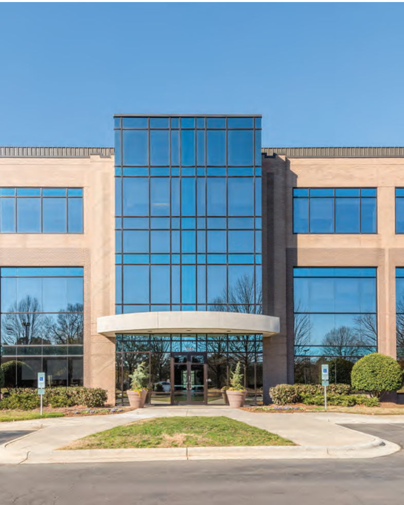
4101 RESEARCH COMMONS