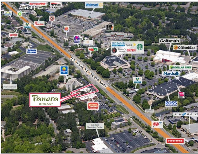
Panera Bread Corporate Hub