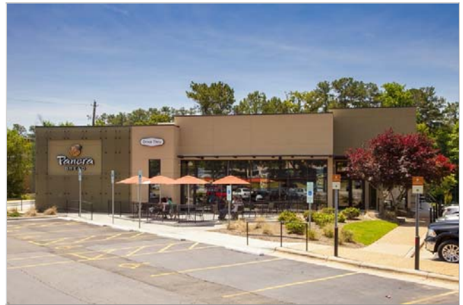
Panera Bread Corporate Hub