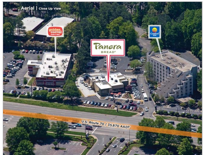
Panera Bread Corporate Hub