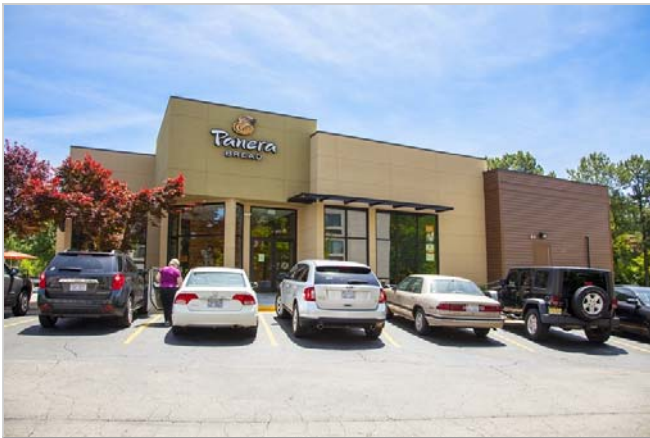
Panera Bread Corporate Hub