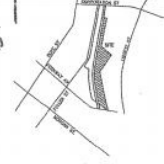
VICINITY MAP NT!

FILED Plat Book 116 Page 27-28 Date 2-14-2000 Time 3:32:40pm RILEY SURVEYING, P.A. 633 GARY STREET DURHAM, N.C. 27703