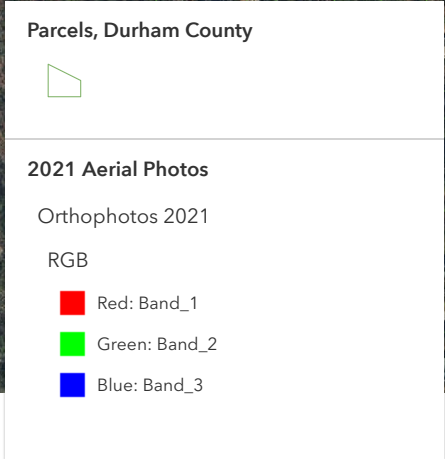
2021 Aerial Photos