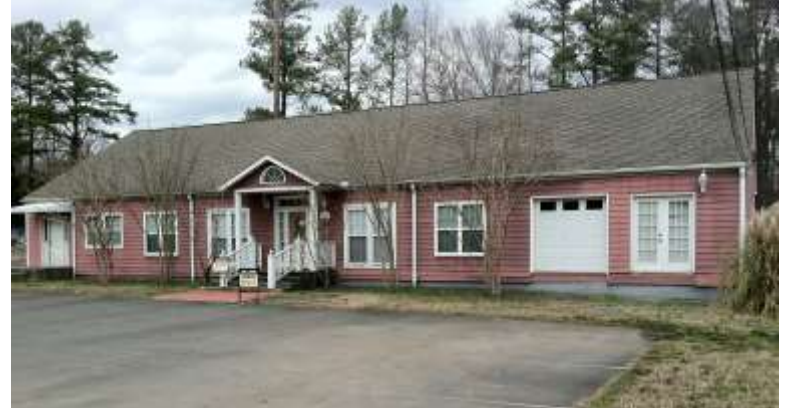
4908 & 4910 Hillsborough Road Durham, NC (Orange County)

Location: West Durham trade area along US 70, close to the intersection with NC 751. Commercial businesses, light industrial buildings, and retail shopping center (Food Lion) are close by.