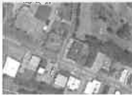
Aerial Map 1