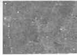
Aerial Map 3