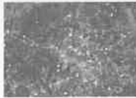
Aerial Map 2