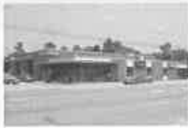
Main Property Photo