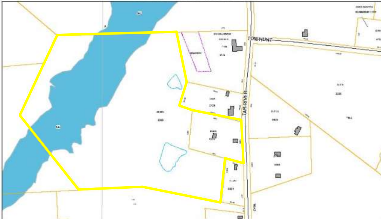
3115 Tar River Rd flood Hazard