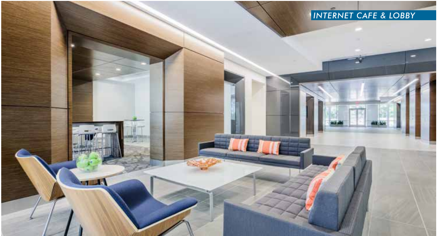
INTERNET CAFE & LOBBY