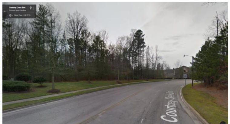
VIEW FROM COURTNEY CREEK DR, PROPERTY ON LEFT