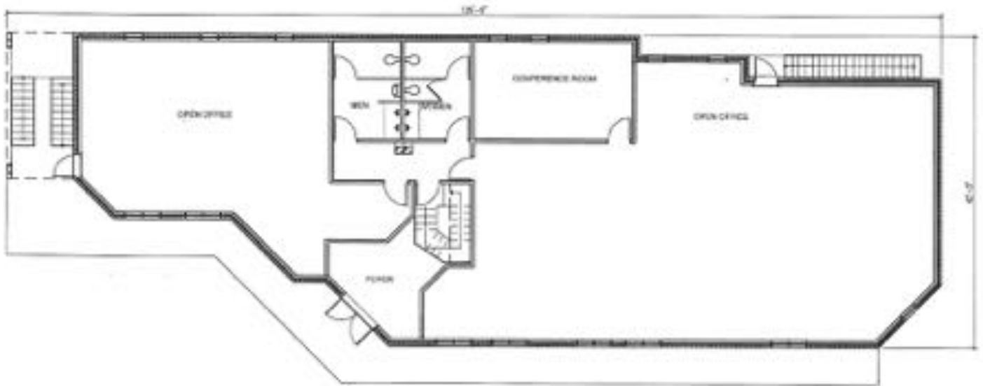
SECOND FLOOR PLAN SCALE: NTS

G-2 TECHNOLOGY CENTER 250 DOMINION DRIVE MORRISVILLE, NC 27560