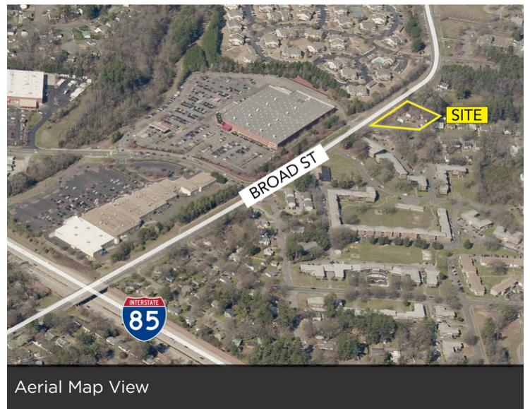
Aerial Map View