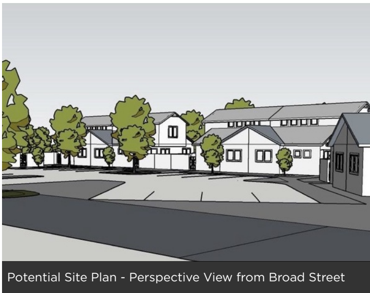
Potential Site Plan - Perspective View from Broad Street