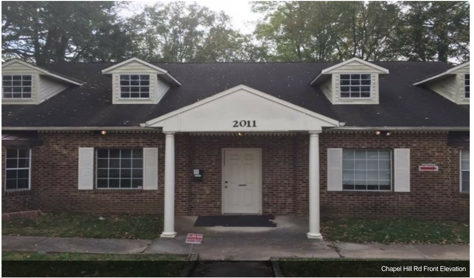
Chapel Hill Rd Front Elevation