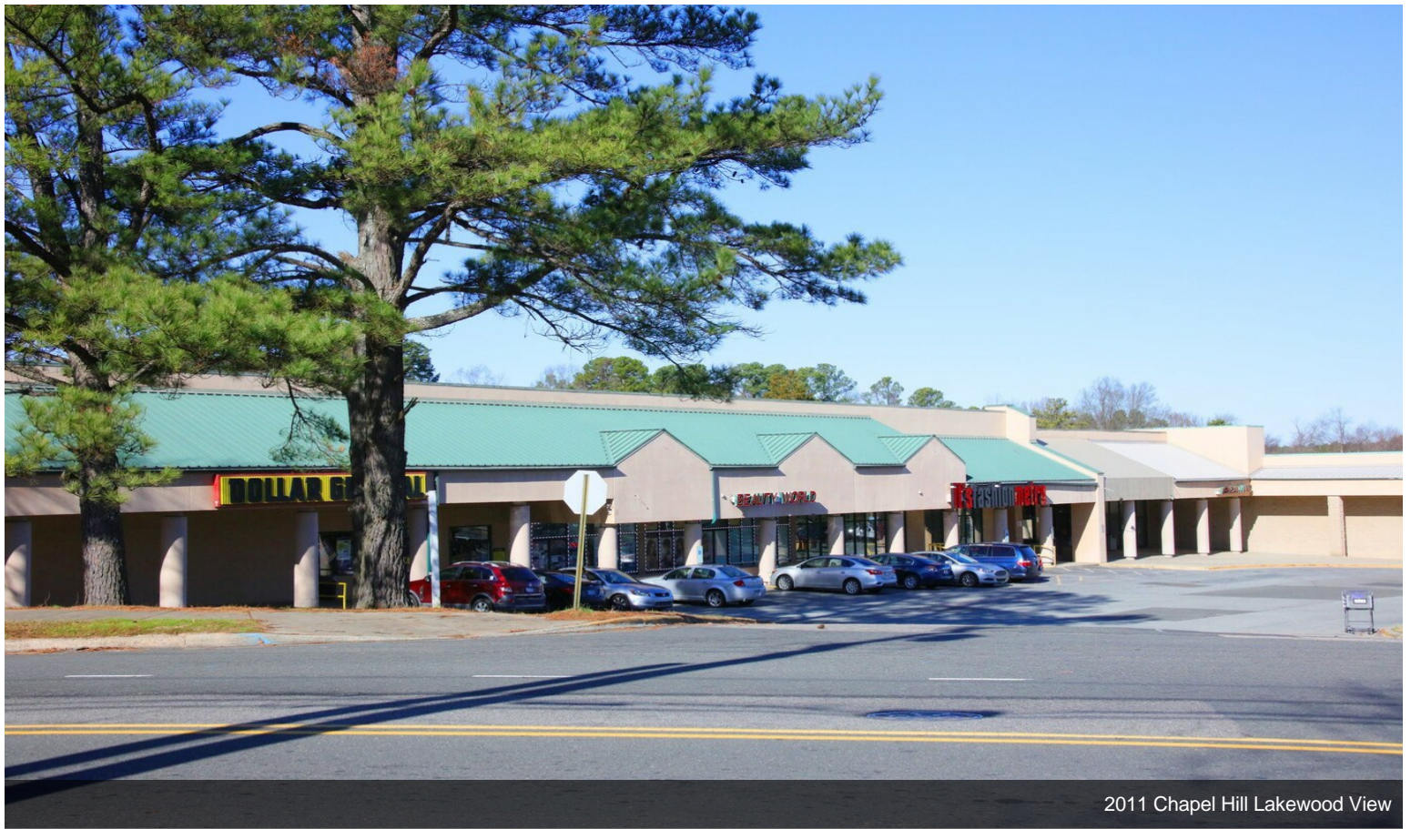
2011 Chapel Hill Lakewood View