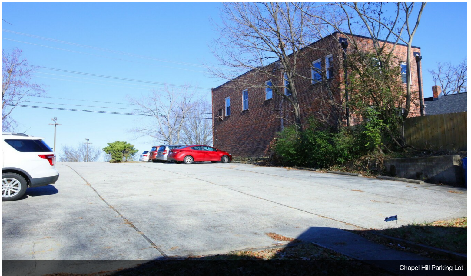
Chapel Hill Parking Lot