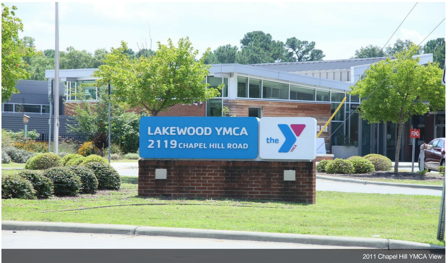
2011 Chapel Hill YMCA View