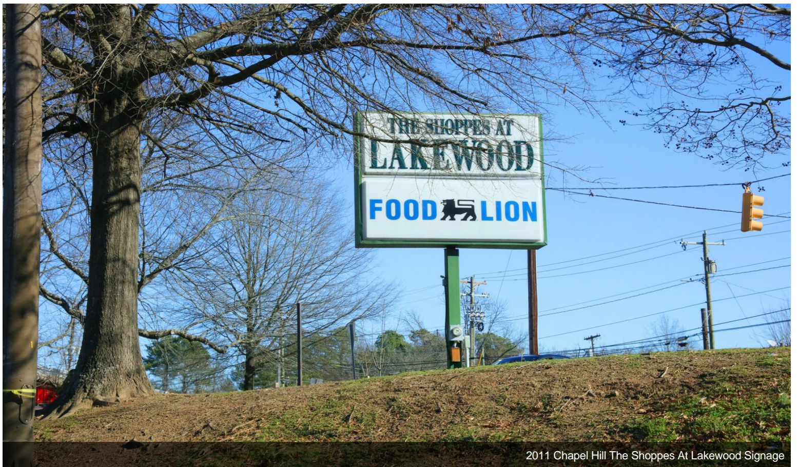
2011 Chapel Hill The Shoppes At Lakewood Signage