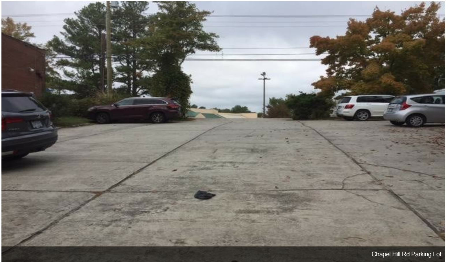
Chapel Hill Rd Parking Lot