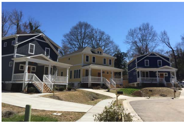
nearby housing construction and rehab