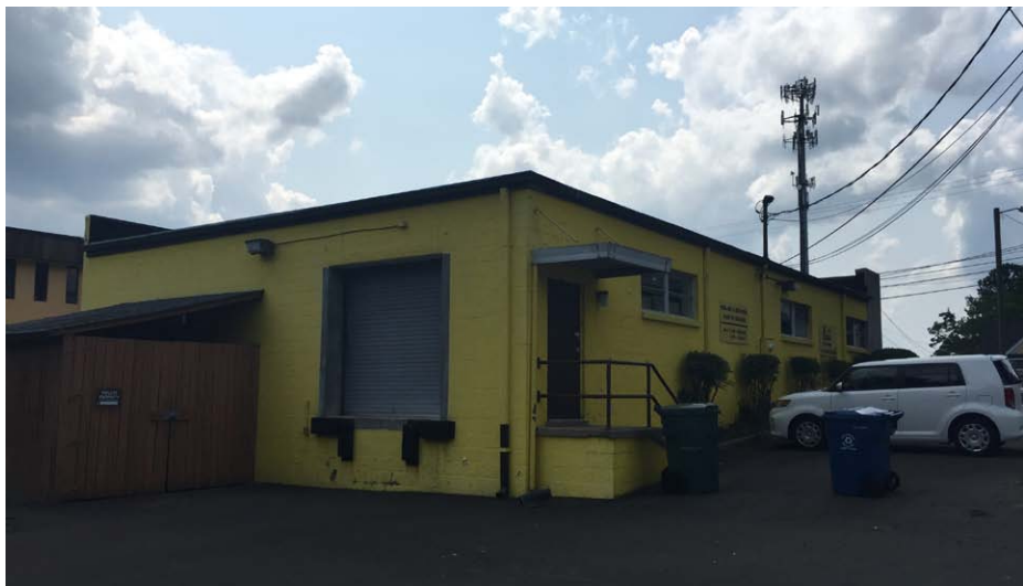
rear of building