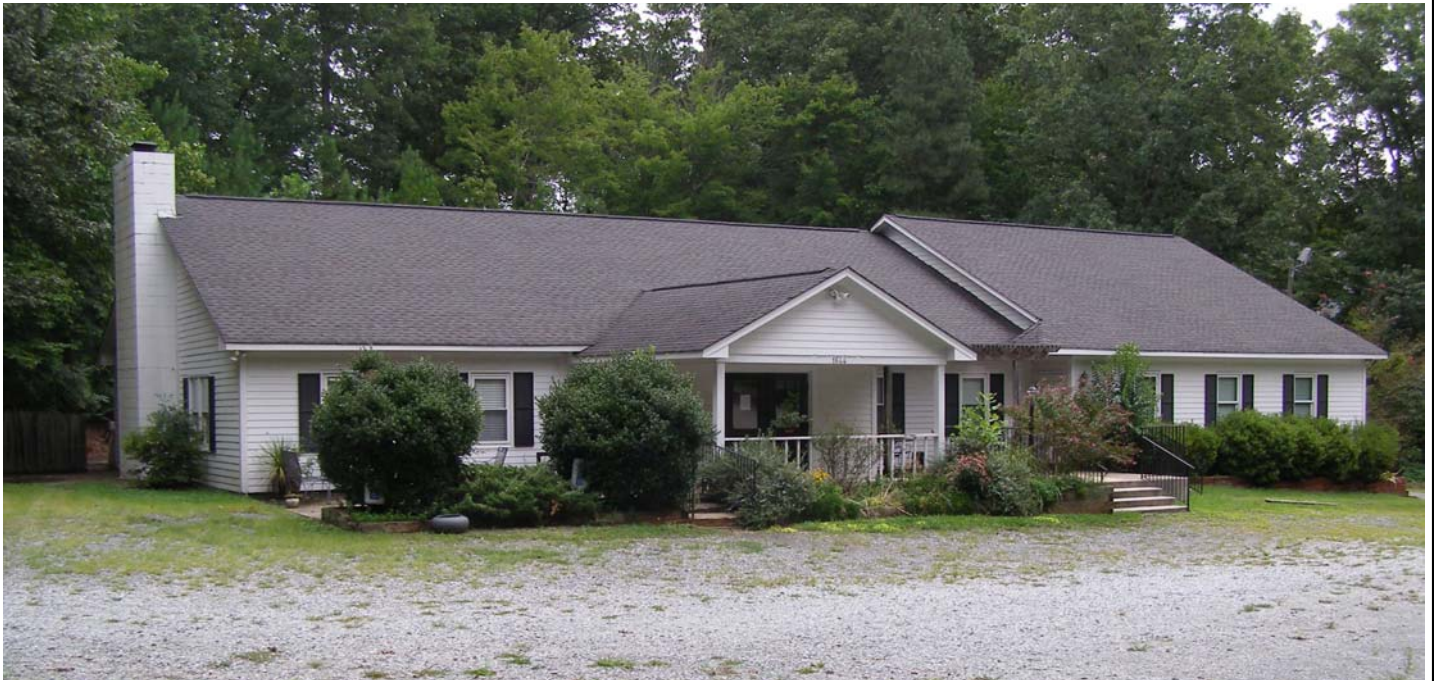
1644 Cole Mill Road—former Diet Center restaurant