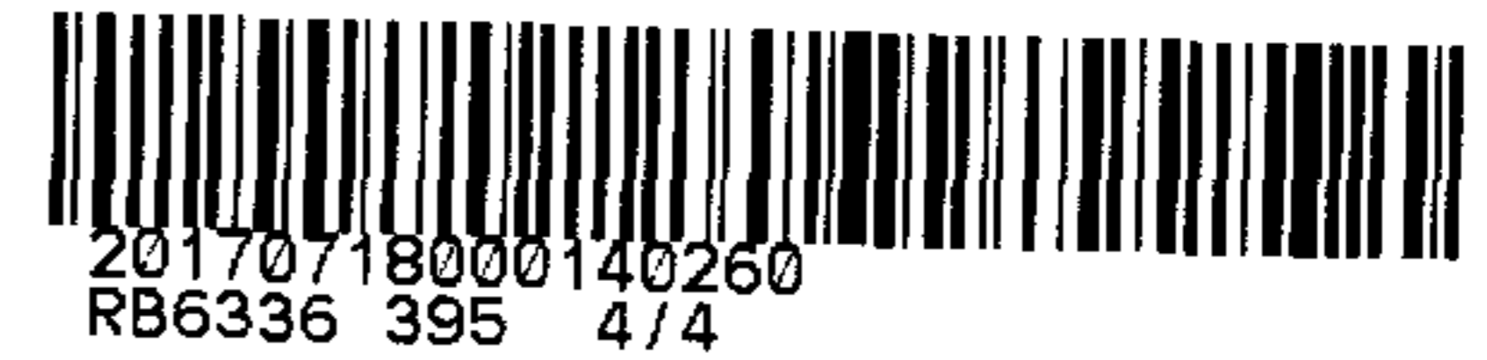
Exhibit A to Deed