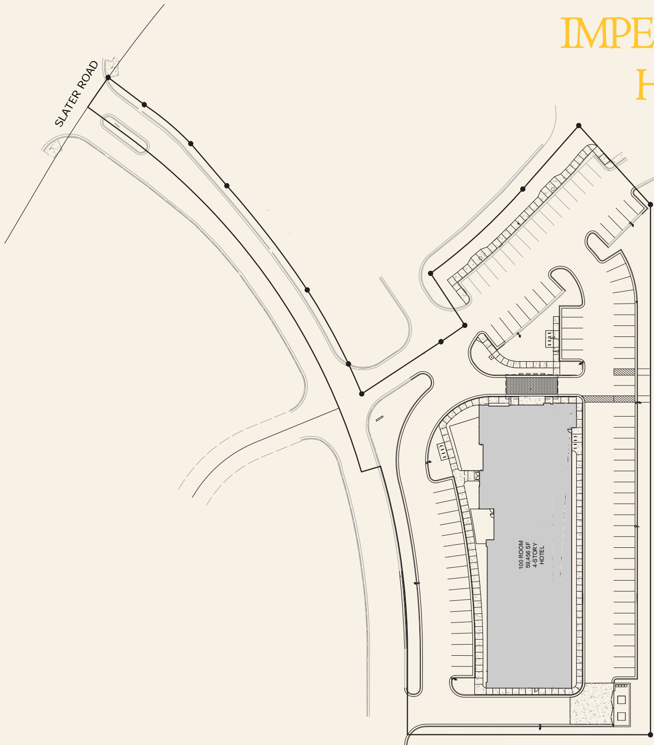
SAMPLE HOTEL SITE PLAN